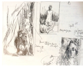
Preparatory composition drawing. 2016

In Marion Colomer's recent work, Melancholia , beauty oscillates between daydreaming and doubt. Colomer's large-scale watercolors guide the viewer toward a different perspective of the intimate. The work is in constant tension of regression, double meaning, and contradiction. In moments of narrative, sometimes the artist presents the Edenic lush jungle, where other times nature is all-consuming and dangerous, speaking to the threat of death that awaits us. Images of raw sexual desire are at once divested of meaning, lifted out of the realm of the pornographic, and detoxified in the soft renderings of drawn bodies, their expressions reflecting the melancholy of lost desire. The bodies are left blank, present in their absence as if their fragrance and essence faded. This series started with the sensuality of a scent, a perfume that would, to some, smell like a lost paradise, with a fragrance of green leaves and rainforest, while others would experience within this effluvia something dangerous, a smell of dampness, or of decomposing soil. For this immersive installation Colomer collaborated with Dana El Masri, NYC based perfumer, creating a original scent.