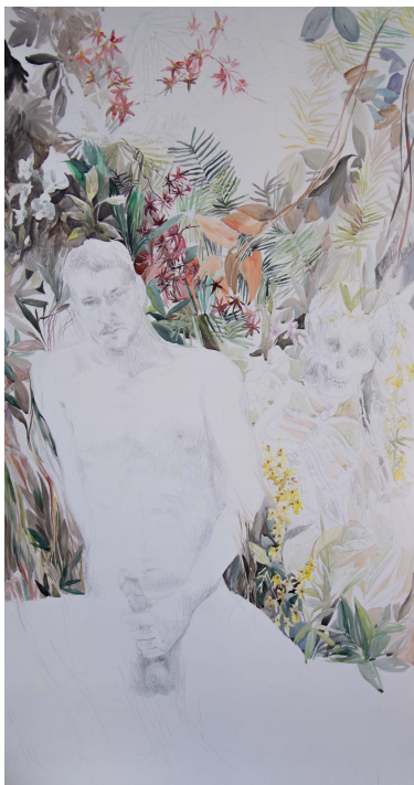
A Man, Watercolor on paper and embroideries. 2016. 78x' 42.5'

In Marion Colomer's recent work, Melancholia , beauty oscillates between daydreaming and doubt. Colomer's large-scale watercolors guide the viewer toward a different perspective of the intimate. The work is in constant tension of regression, double meaning, and contradiction. In moments of narrative, sometimes the artist presents the Edenic lush jungle, where other times nature is all-consuming and dangerous, speaking to the threat of death that awaits us. Images of raw sexual desire are at once divested of meaning, lifted out of the realm of the pornographic, and detoxified in the soft renderings of drawn bodies, their expressions reflecting the melancholy of lost desire. The bodies are left blank, present in their absence as if their fragrance and essence faded. This series started with the sensuality of a scent, a perfume that would, to some, smell like a lost paradise, with a fragrance of green leaves and rainforest, while others would experience within this effluvia something dangerous, a smell of dampness, or of decomposing soil. For this immersive installation Colomer collaborated with Dana El Masri, NYC based perfumer, creating a original scent.