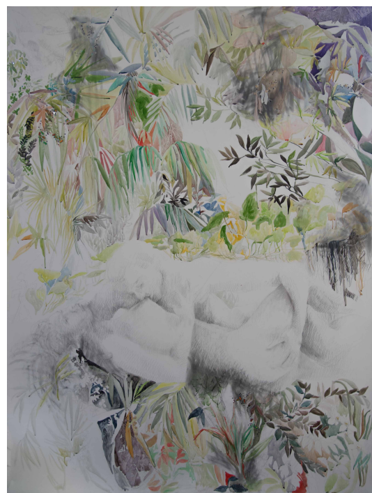
A couple, Watercolor on polyethylene paper and embroideries. 2016. 78'x 60'